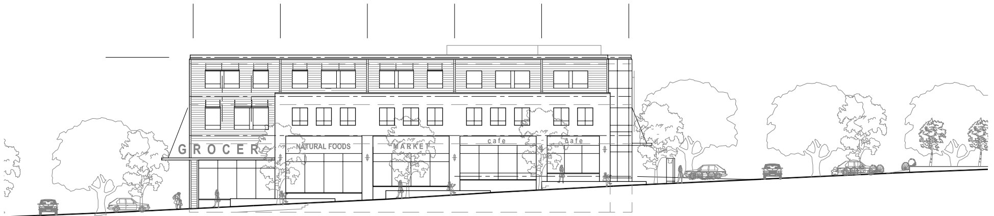
1 Parcel W - Washington Street (East) Elevation SCALE: 1" = 30'-0"