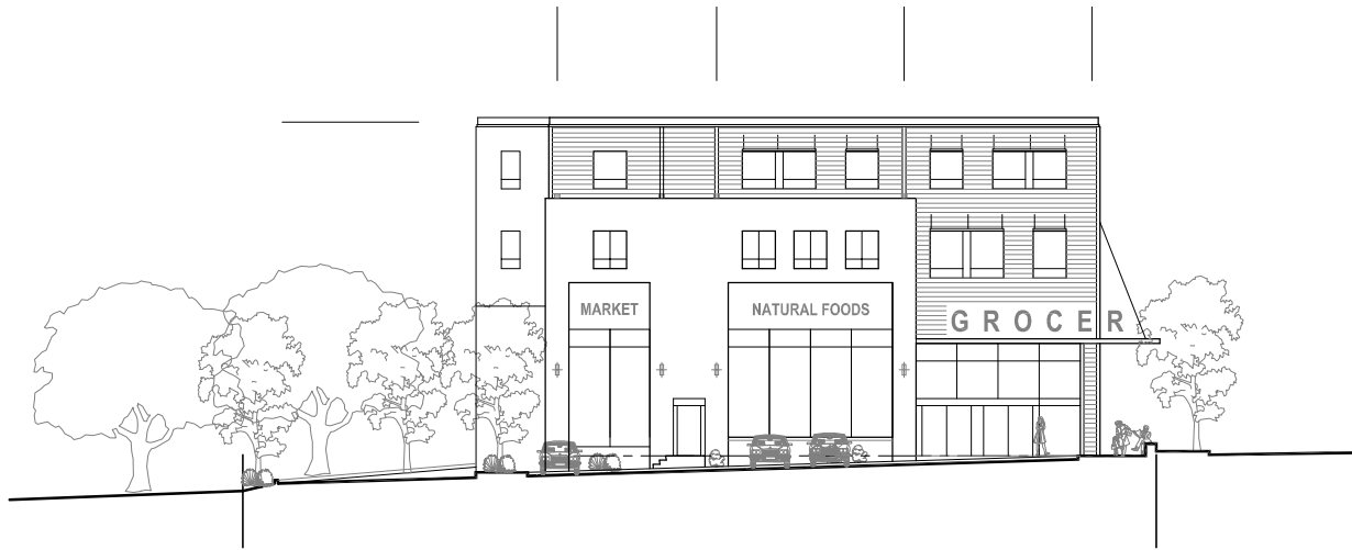
2 Parcel W - South Elevation SCALE: 1" = 30'-0"

The design shown on this drawing is the property of Forte Architecture + Design and is not to be used or disclosed, in whole or in part, except in accordance with a contract, license or agreement in writing with Forte Architecture + Design.