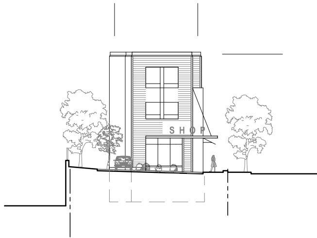
2 Parcel V - North Elevation

The design shown on this drawing is the property of Forte Architecture + Design and is not to be used or disclosed, in whole or in part, except in accordance with a contract, license or agreement in writing with Forte Architecture + Design.