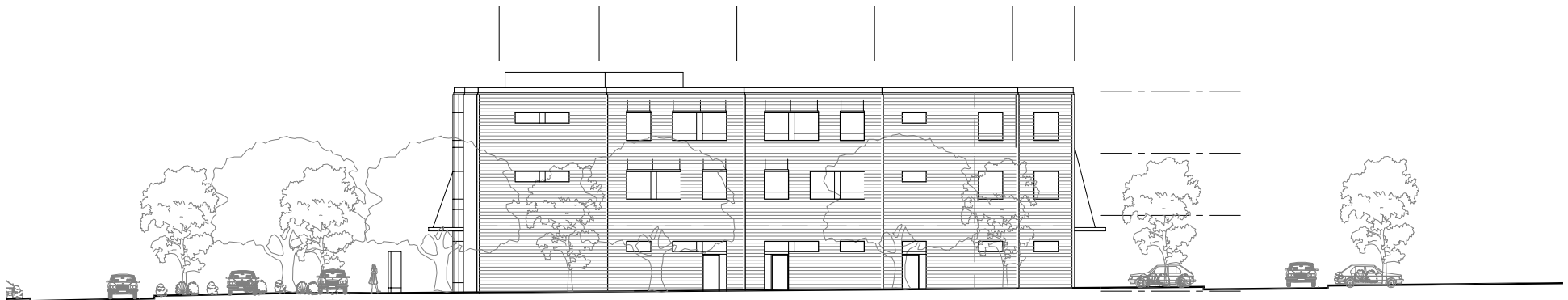
1 Parcel V - East Elevation