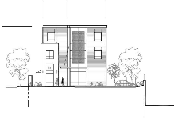
2 Parcel V - South Elevation SCALE: 1" = 30'-0"

The design shown on this drawing is the property of Forte Architecture + Design and is not to be used or disclosed, in whole or in part, except in accordance with a contract, license or agreement in writing with Forte Architecture + Design.