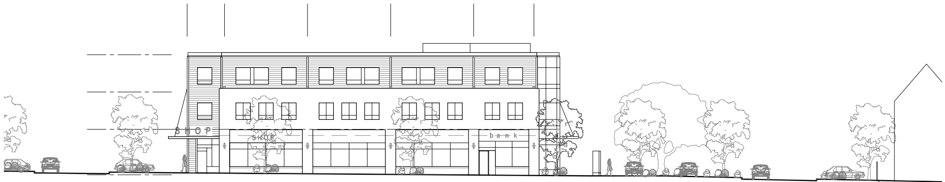
1 Parcel V - Washington Street (West) Elevation SCALE: 1" = 30'-0"